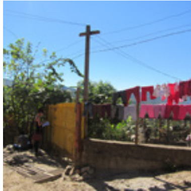
Figure 6.2 Questionnaire interviews in Alto do Rosário.

With those results in mind, the community leaders started a conversation with the prefecture, and infrastructure in Alto do Rosário gained momentum. Politically, infrastructure is appealing, as for each service provided, there is room for political publicity. As shown in Figure 6.3, the process of urban development in Alto do Rosário was featured in political ads.