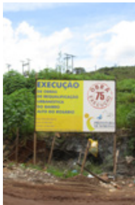
Figure 6.3 Political ads promoting infrastructure improvements.

With those results in mind, the community leaders started a conversation with the prefecture, and infrastructure in Alto do Rosário gained momentum. Politically, infrastructure is appealing, as for each service provided, there is room for political publicity. As shown in Figure 6.3, the process of urban development in Alto do Rosário was featured in political ads.