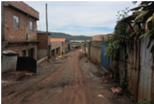
Figure 6.1 Alto do Rosário, in Mariana, Brazil.

Alto do Rosário offers the answer. This neighbourhood starts where public transport, garbage collection, electricity, sewage and asphalt end (Figure 6.1). One needs to access the area by foot because for vehicles the uneven, labyrinthine and unnamed alleys offer great obstacles. The uneven streets in Alto do Rosário follow the course of the houses, rather than the other way around. Houses are, however, built to remain. No constructions are temporary: they are made of bricks and concrete. Like in other areas of Brazil, housing settlements start in chaotic ways, with small improvements usually made by residents, until the area – looking somehow ‘right’ – becomes legal and people receive tenure rights, or house papers, as they are known.